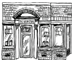
THE BOOKSTORE GET LIT Wine Bar